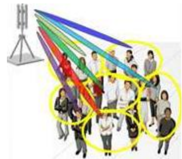
Beams from 5G base stations

Each 5G base station will contain hundreds or thousands of antennas aiming multiple laser-like beams simultaneously at all cell phones and user devices in its service area. This technology is called “multiple input multiple output” or MIMO. FCC rules permit the effective radiated power of a 5G base station’s beams to be as much as 30,000 watts per 100 MHz of spectrum, 2 or equivalently 300,000 watts per GHz of spectrum, tens to hundreds of times more powerful than the levels permitted for current base stations.